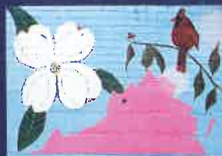
"Virginia" East Main Street at Slye Pocket Park Artist: Weldon Bagwell