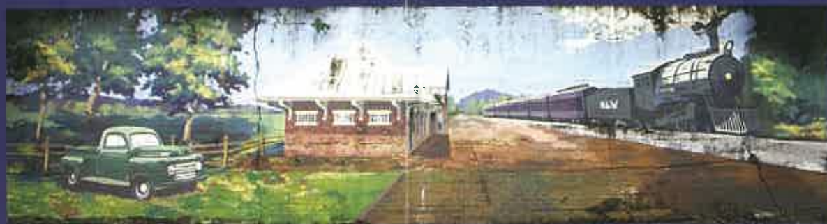
"Norfolk and Western Train Station 1940's" East Main Street Public Parking Lot • Artist: Jennifer Brady