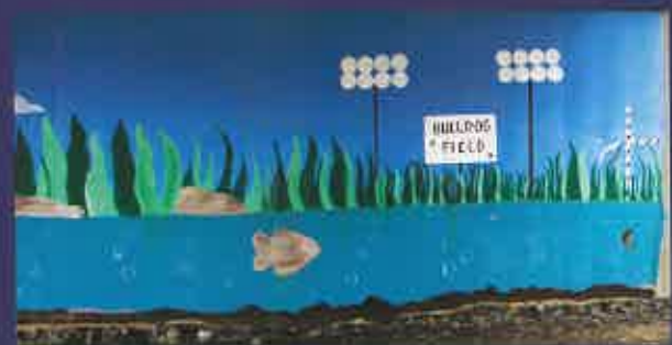
"Hawksbill Critters Root for the Bulldogs" Under 211 Bypass on the Greenway • Artist: L.H.S. Art Class