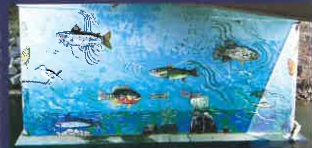
"Natural History of Hawksbill Creek" Under 340 Bridge • Artist: Weldon Bagwell